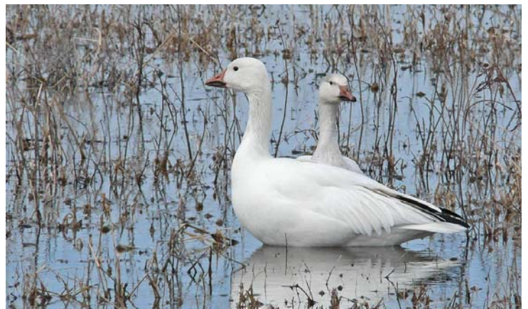
Snow Geese at Hagerman National Wildlife Refuge Photo by Tom Heath on January Field Trip