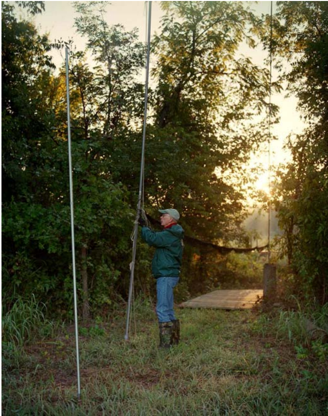
Above: Tom Heath erects a mist net.

B anding has proved an extraordinary tool for conservationists. With the data collected, scientists can track migration routes, monitor population stability and genetic diversity, follow the spread of avian diseases, as well as better understand the breeding and feeding patterns of different species. Although the banders must obtain an immense amount of data, they process each bird with striking gentleness and swiftness. The birds' welfare is always the primary concern, and hopefully their species will see pay back for the small amount of discomfort that they experience through conservation efforts birthed from the analysis of banding data.