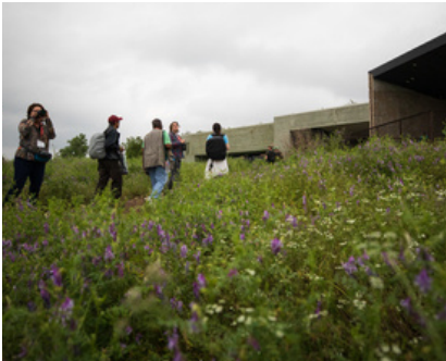
Trinity River Audubon Center